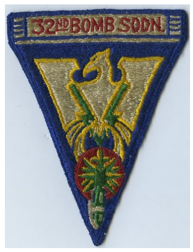
32 Bombardment Squadron, Medium